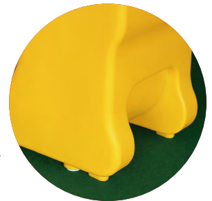
Easily discharge water in tank with the drainage hole at the base.