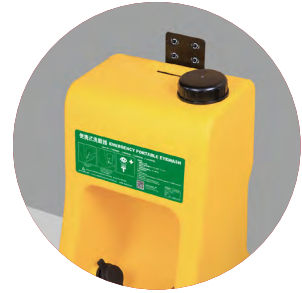
Can be hung on the wall, reasonable space saving.