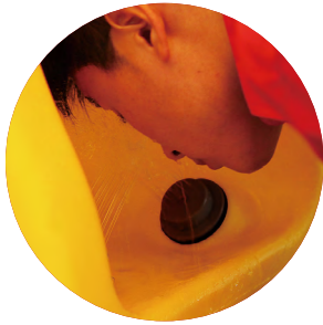
Flushing time exceed ANSI standard.